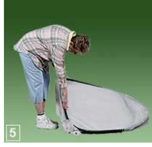
Step 4: Folding one panel on top of the other panel your PlantHouse™ should be one flat panel. Shown in Photos 4 & 5.