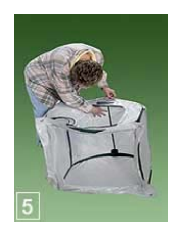
Step 5: Assemble the fiber pole provided. Insert the capped ends into the pockets above the doorway and opposite end.