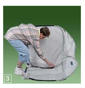
Step 3: Push on the center steel band. The two top bands must be forced to lay uniformly on top of the two bottom bands so your PlantHouse™ will fold into two panels.