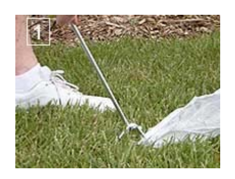
Step 1: Begin first by removing all of the stakes. It may be easier for you to use one take to remove another.