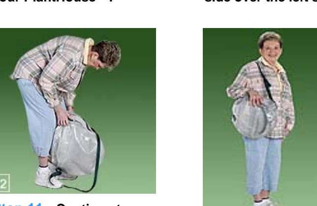
Step 11: Continue to slide your PlantHouse™ into your carry pack. Store the stakes in their pouches and place, along with your fiber pole into the pack.