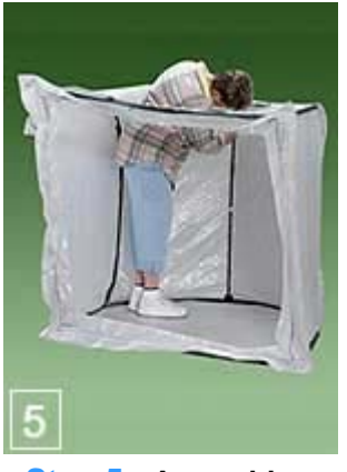
Step 5: Assemble the fiber pole provided. Insert the capped ends into the pockets above the doorway and opposite end.