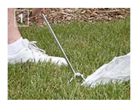
Step 1: Begin first by removing all of the stakes. It may be easier for you to use one take to remove another.