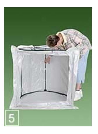
Step 5: Assemble the fiber pole provided. Insert the capped ends into the pockets above the doorway and opposite end.