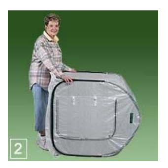
Step 2: Be sure your doors and screens are zipped closed, then place your PlantHouse™ on it's side and remove the fiber pole from the ceiling.