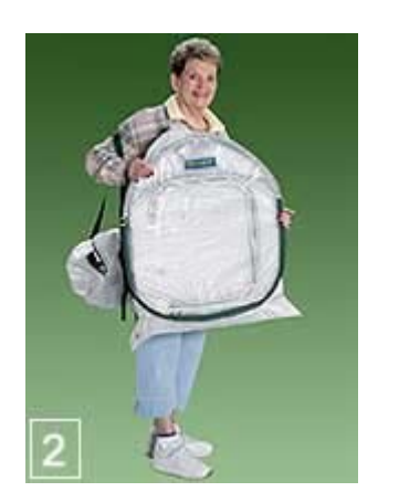
Step 2: Allow your PlantHouse 2' ™ to spring open. CAUTION: Be Sure to hold your PlantHouse™ away from your face as it will Spring open.