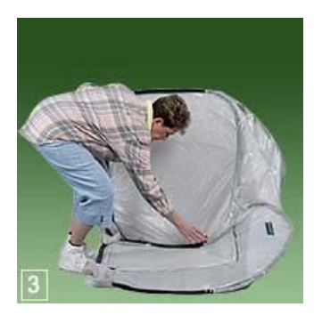
Step 3: Push on the center steel band. The two top bands must be forced to lay uniformly on top of the two bottom bands so your PlantHouse™ will fold into two panels.