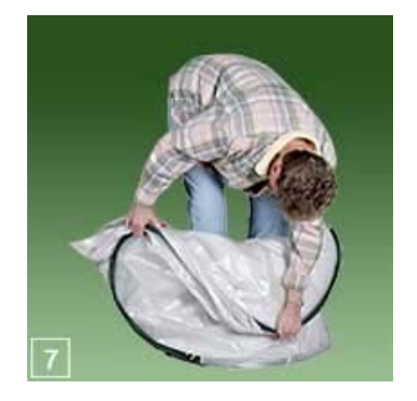
Step 5: Choosing the top corner, fold your PlantHouse™ in half. You will feel the tension of the spring steel. Continue folding under while you bring the left side up and over. Your PlantHouse™ should resemble a taco. See photos 6 & 7.