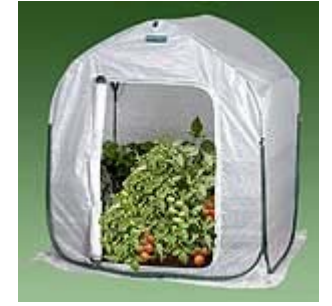
Step 6: The doorway and screen can be secured open either together or separate. Simply unzip the doorway and/or screen. Roll them long way. Secure with the straps provided.