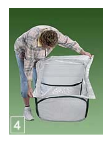
Step 4: Grab the center steel band and lift up to separate the two sides of your PlantHouse™. Smooth and unfold the skirting.