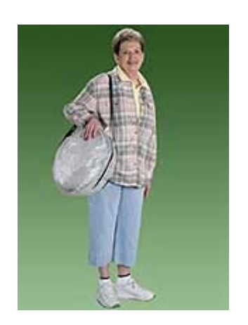
Step 1: Remove your PlantHouse 2'™ from the pack.