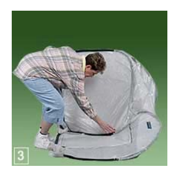
Step 3: Push on the center steel band. The two top bands must be forced to lay uniformly on top of the two bottom bands so your PlantHouse™ will fold into two panels.