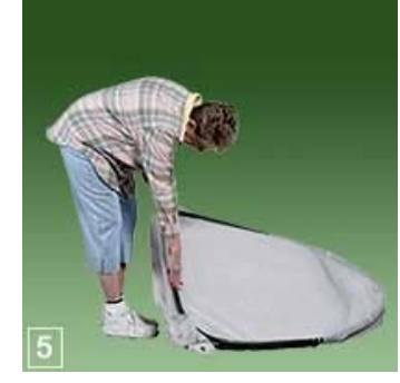
Step 4: Folding one panel on top of the other panel your PlantHouse™ should be one flat panel. Shown in Photos 4 & 5.