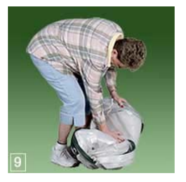
Step 8: Fold the right side over the left side.