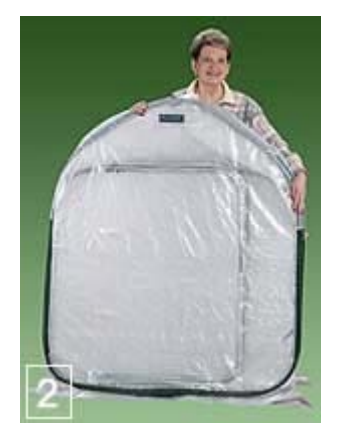
Step 2: Allow your PlantHouse™ to spring open. CAUTION: Be Sure to hold your PlantHouse™ away from your face as it will Spring open.