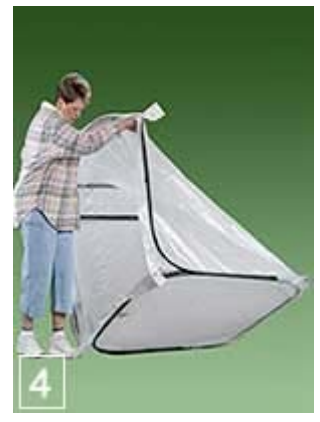
Step 4: Grab the center steel band and lift up to separate the two sides of your PlantHouse™. Smooth and unfold the skirting.