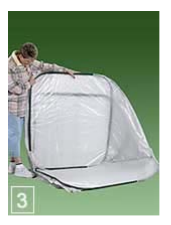
Step 3: Unfold your PlantHouse™ into 2 panels.