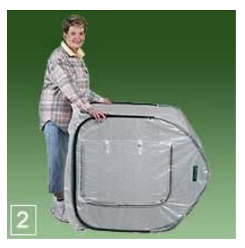
Step 2: Be sure your doors and screens are zipped closed, then place your PlantHouse™ on it's side and remove the fiber pole from the ceiling.