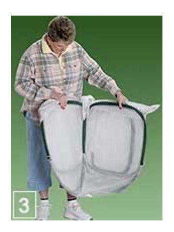
Step 3: Unfold your PlantHouse 2'™ into 2 panels.