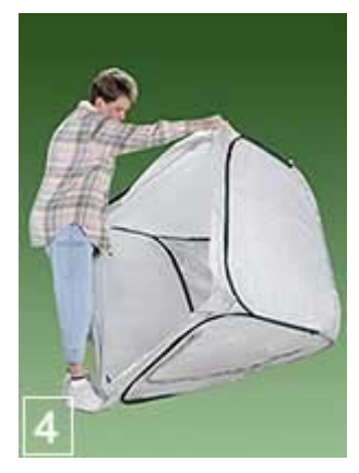
Step 4: Grab the center steel band and lift up to separate the two sides of your PlantHouse™. Smooth and unfold the skirting.