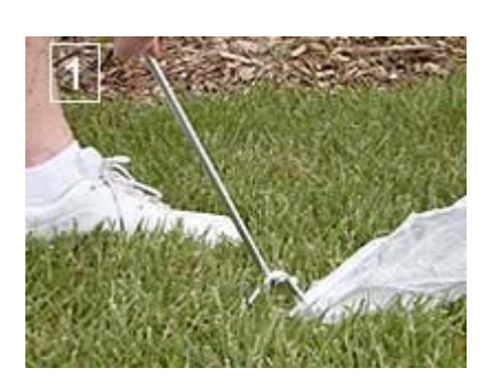
Step 1: Begin first by removing all of the stakes. It may be easier for you to use one stake to remove another.