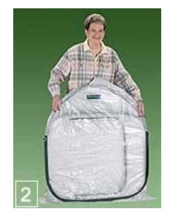
Step 2: Allow your PlantHouse™ to spring open. CAUTION: Be Sure to hold your PlantHouse™ away from your face as it will Spring open.