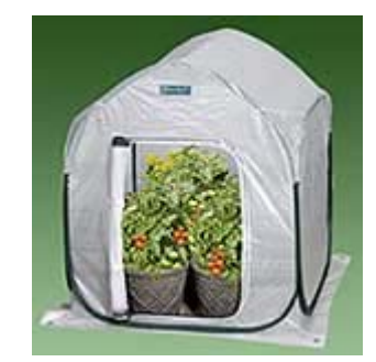
Step 6: The doorway and screen can be secured open either together or separate. Simply unzip the doorway and/or screen. Roll them long way. Secure with the straps provided.