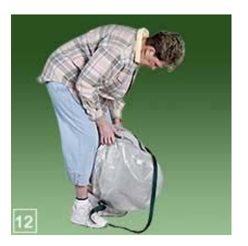
Step 11: Continue to slide your PlantHouse™ into your carry pack. Store the stakes in their pouches and place, along with your fiber pole into the pack.