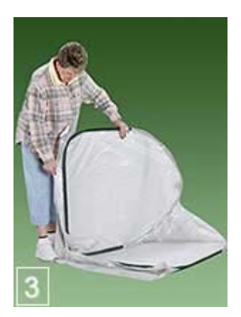
Step 3: Unfold your PlantHouse™ into 2 panels.