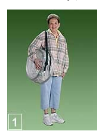
Step 1: Remove your PlantHouse™ from the pack.