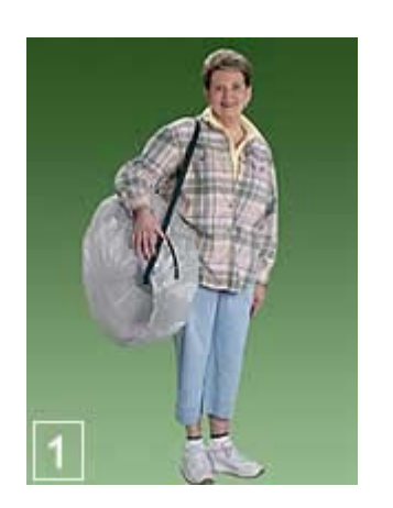
Step 1: Remove your PlantHouse™ from the pack.