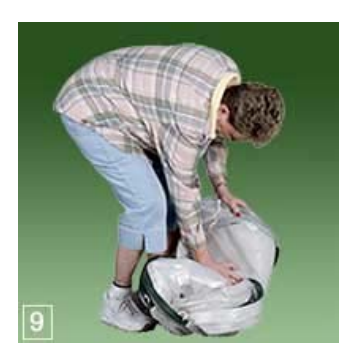
Step 8: Fold the right side over the left side.