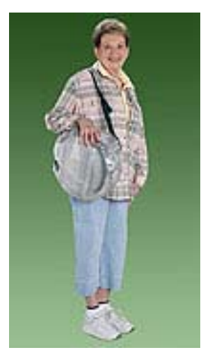
Now your ready to take your PlantHouse™ anywhere.