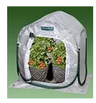
Step 6: The doorway and screen can be secured open either together or separate. Simply unzip the doorway and/or screen. Roll them long way. Secure with the straps provided.