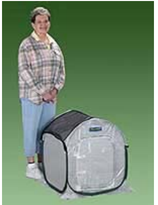
Attach your shade cover for added protection.