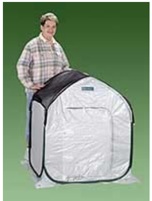
Attach your shade cover for added protection for nature's harshest elements.