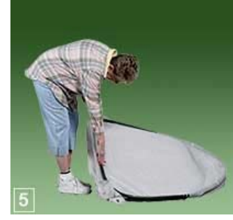
Step 4: Folding one panel on top of the other panel your PlantHouse™ should be one flat panel. Shown in Photos 4 & 5.